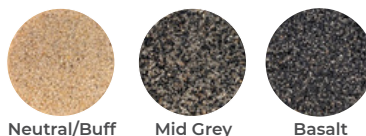
AVAILABLE IN THREE VERSATILE COLOURS