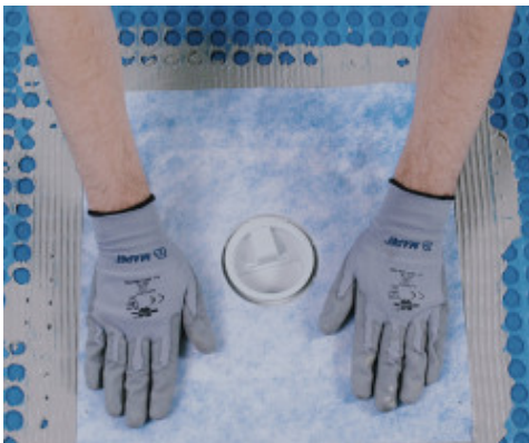
Waterproof drains with Drain Vertical/Drain Lateral