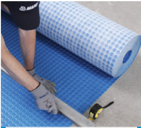
Cutting Mapeguard UM 35