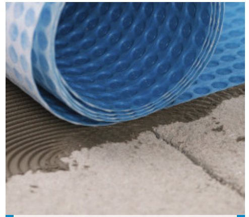
Laying of Mapeguard UM 35