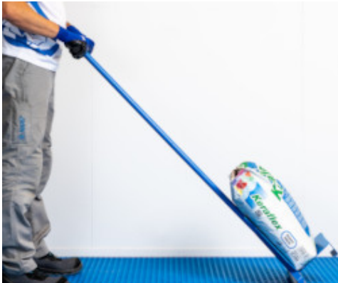
Pressing Mapeguard UM 35 using Mapeguard Roller