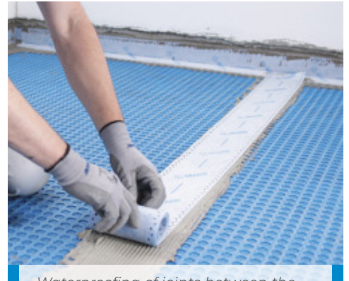
Waterproofing of joints between the sheets with Mapeband Easy, bonded with Mapeguard WP Adhesive