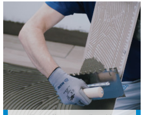
Install ceramic or stone tiles with a suitable Mapei adhesive of at least C2 class