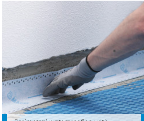
Perimetral waterproofing with Mapeband Easy, bonded with Mapeguard WP Adhesive