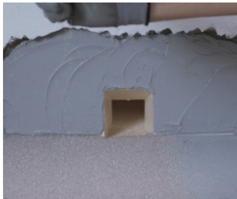
Waterproof drains with Drain Front